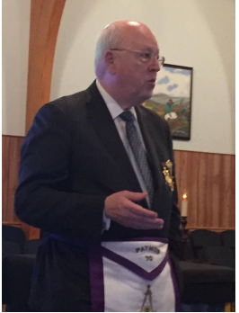
Y ^Á ^!Á!Q} |!áÁ ãÖÁ ]!•^} çæ} Á~Á~!Á^} [ , } Á { ^{ á!ÁÖ!| ÉÖ!^} Ó! [!áÁ